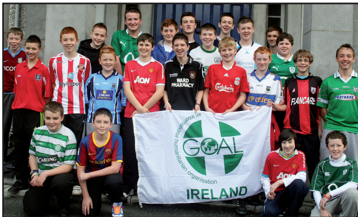
Class 111, 2nd year, St Mels College had a Jersey day in October 2011 to raise funds for school children in Calcutta, India to help provide them with running water for a school over there. The boys raised €850 which will make a huge difference to their fellow students who are less fortunate.

So on behalf of GOAL, a simple but sincere thank you.