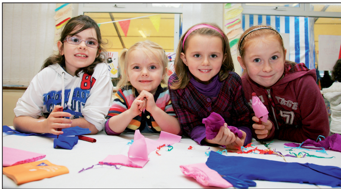
Children enjoying the exciting activities at the Aisling Free Family Day.